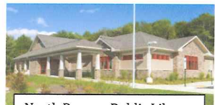
North Pocono Public Library

Contact (570) 963-6820 ext. 1505 or 570-507-3300 for